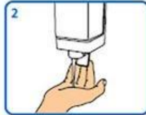
2 Apply enough soap to cover all hand surfaces