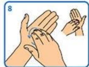
8 Rub tips of fingers in opposite palm in a circular motion