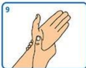
9 Rub each wrist with opposite hand