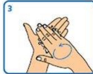
3 Rub hands palm to palm