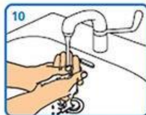
10 Rinse hands with water