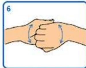
6 Rub with back of fingers to opposing palms with fingers interlocked