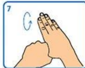
7 Rub each thumb clasped in opposite hand using a rotational movement