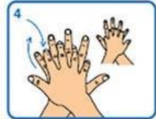
4 Rub back of each hand with palm of other hand with fingers interlaced