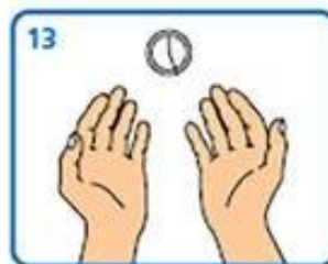
13 Hand washing should take 15–30 seconds