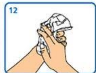
12 Dry thoroughly with a single-use towel