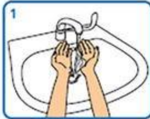
1 Wet hands with water