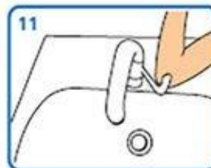
11 Use elbow to turn off tap