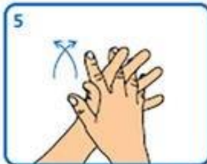
5 Rub palm to palm with fingers interlaced